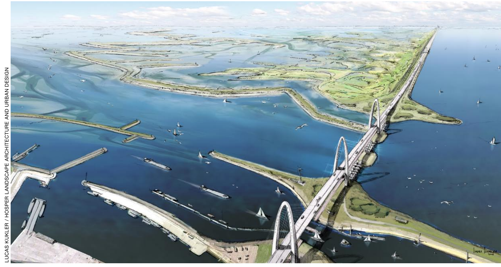
This new idea for the 36 km long Dutch seabarrier the 'Afsluitdijk' does not involve raising the height of the barrier, but establishes natural tidal marshes on the sea side, to bear the brunt of occasional storm surges.

have vanished, flood damage is many times worse. "Just as in the past", Hoang says, "mangrove forests must join up to form a connected system. In all of these areas, connectivity is the key, so that species can move and processes can function appropriately." The WWF is seeking to put the importance of reclaiming delta ecosystems on the map with the World Estuary Alliance (WEA).