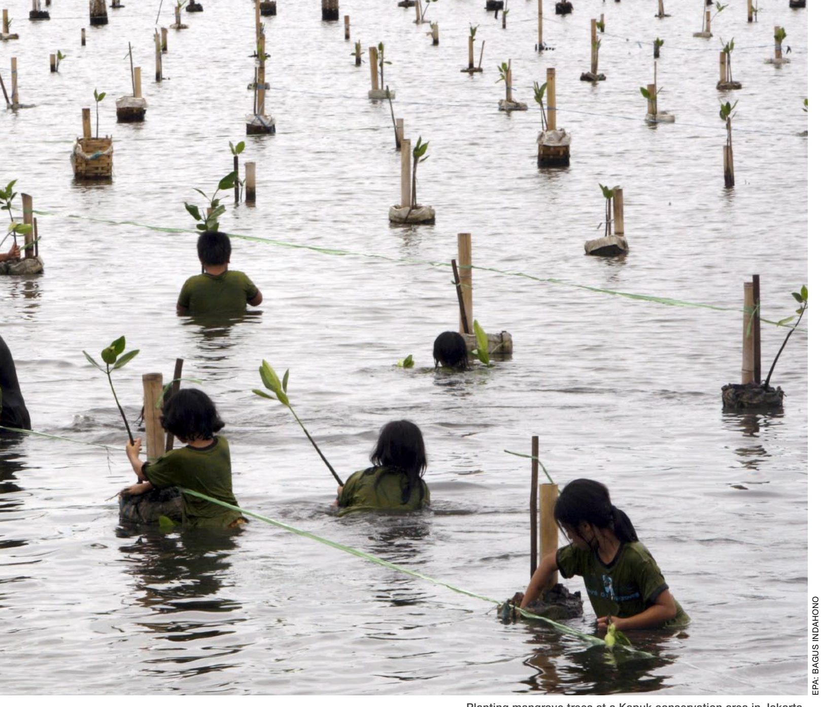
Planting mangrove trees at a Kapuk conservation area in Jakarta.

Investing in biologically diverse ecosystems lowers the risk of large losses to ecosystems and the services they provide when a drought or flood occurs.